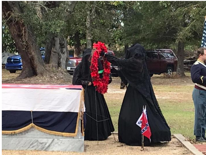
The Black Roses of the OCR placed the wreath at the Tomb of the Unknown Soldier.