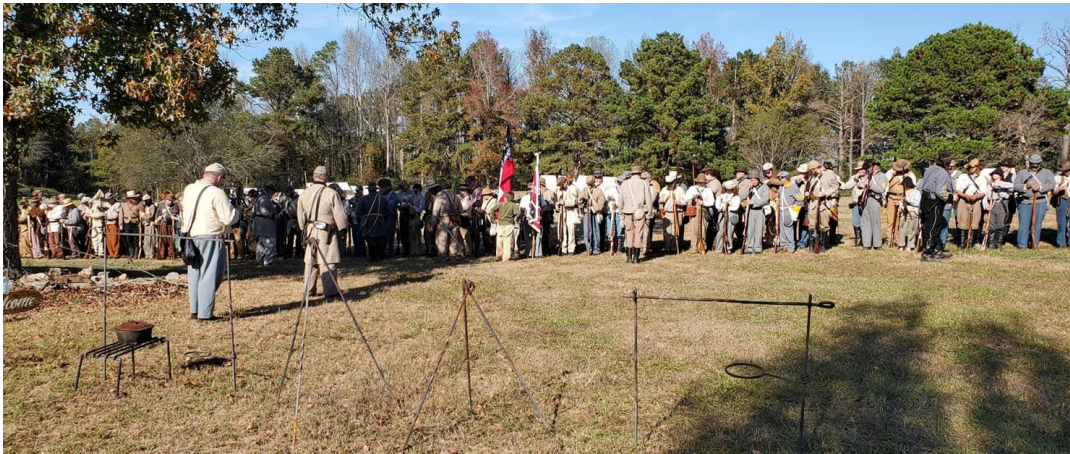
The Confederates formed up to do battle with Yankees at the Tallassee Reenactment.