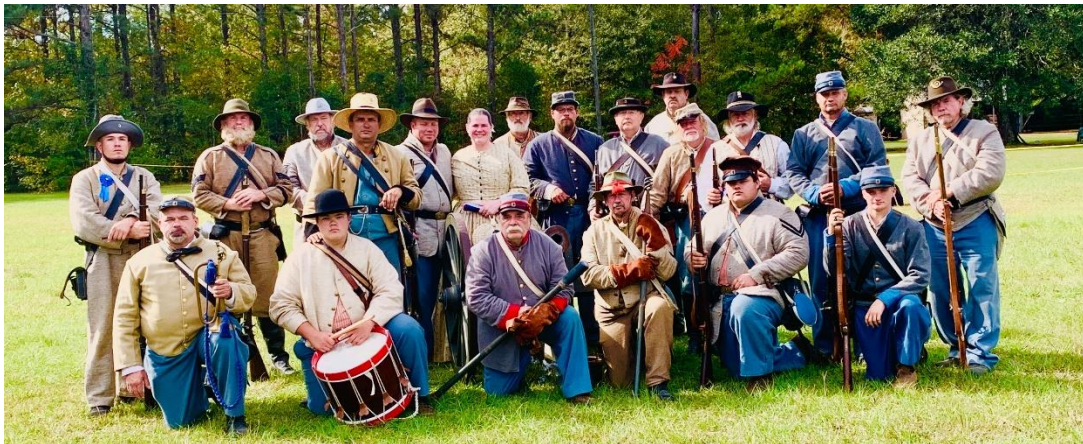
The 3 rd Miss. Inf. and 7 Stars Artillery posed for a pic after shooting ashes out of the cannon.