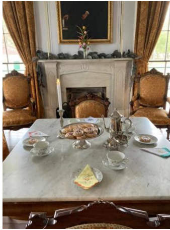
The Mansion was decorated on Saturday November 28, 2020 by Camp Members.