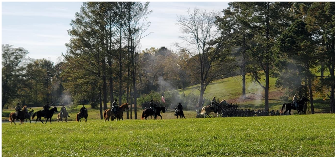
The battle for the Armory rages on with cavalry involved on November 14, 2020.