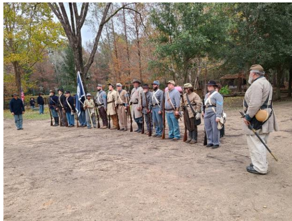
The reenactors posed for this photo at the end of the battle and fired a volley for the crowd.