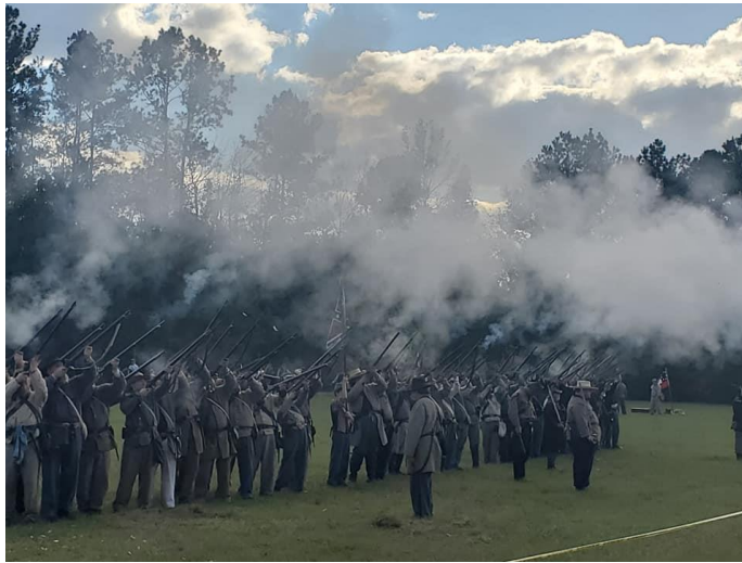
The participants at the Camp Moore Reenactment fired a volley at the end of the battle.