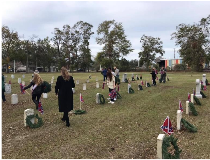
Volunteers put out the wreaths on each grave in the cemetery at Beauvoir Dec. 5, 2020.