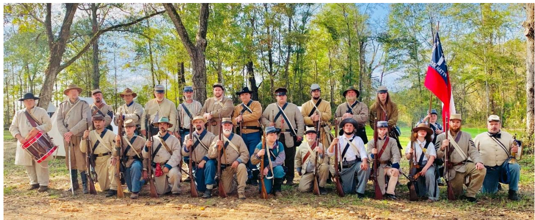
The 3 rd Miss. Inf. posed for a photo with the 18 th Ala. Inf. at Tallassee, AL.