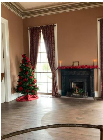
The Mansion was decorated on Saturday November 28, 2020 by Camp Members.