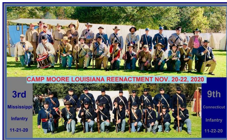
The 3 rd Miss. Inf. portayed the Shieldsboro Rifles on Saturday and the 9 th Conn. Inf. Sunday.