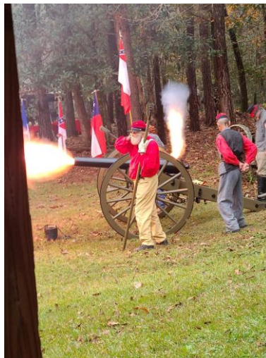
The Confederate artillery fired at Landrum's Homestead on November 28, 2020.