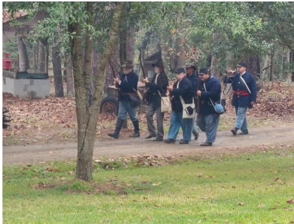
The 9 th Connecticut formed up to do battle with the Rebs at Landrum's Homestead.